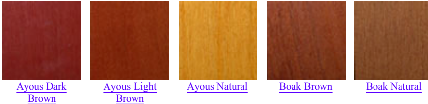
Ayous Dark Brown